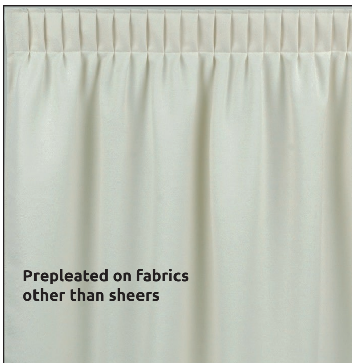
Prepleated on fabrics other than sheers